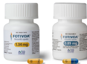
Actual pill size may differ